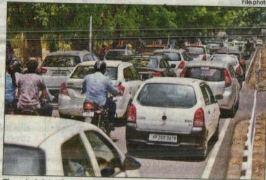
The administration hopes the new system will reduce chaos on road during rush hours in the morning and evening

If the results are positive, the system will be followed on more roads, mainly from Panchkula and Mohali. A se-