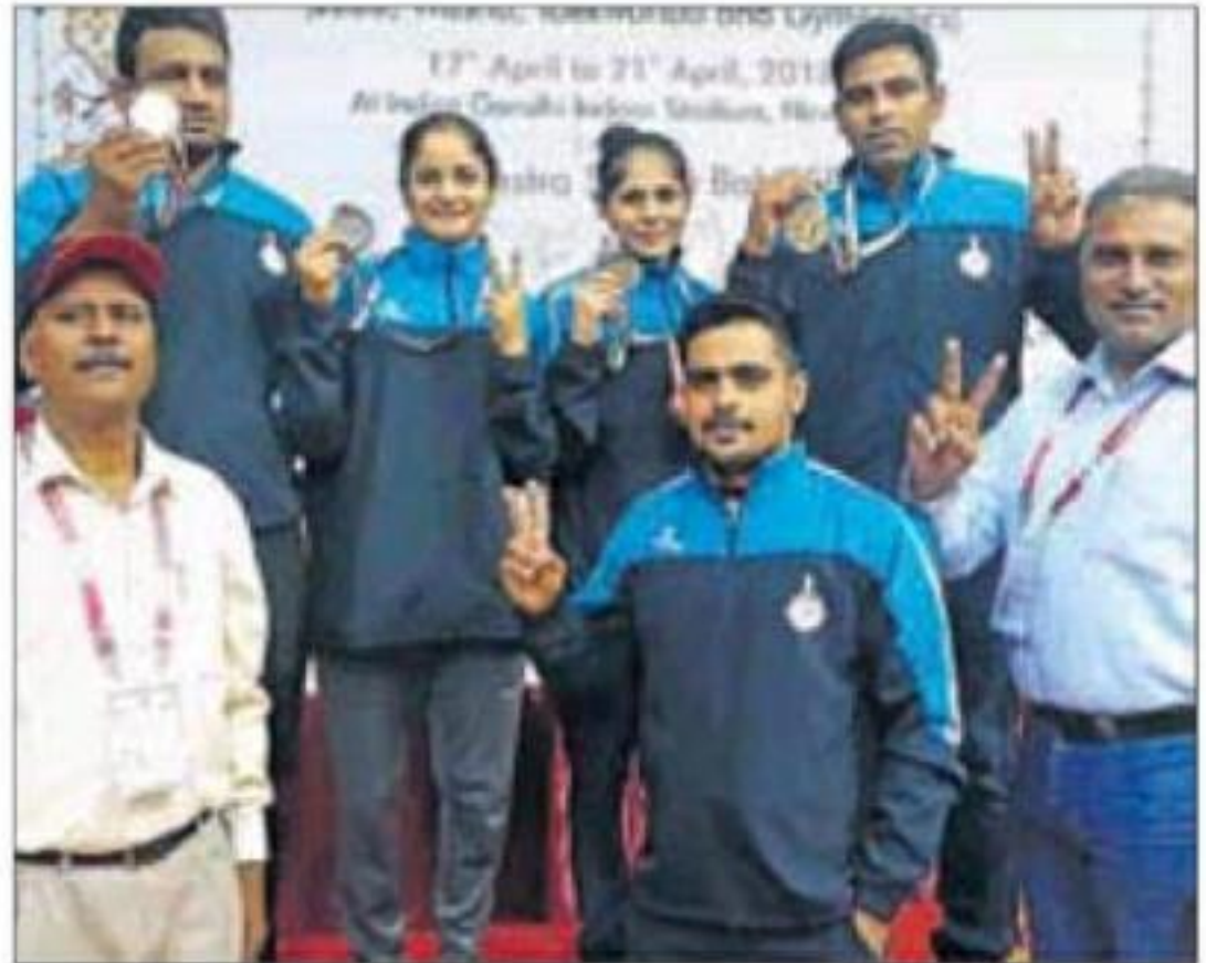
■ UT players who won medals in All India Police Judo meet.