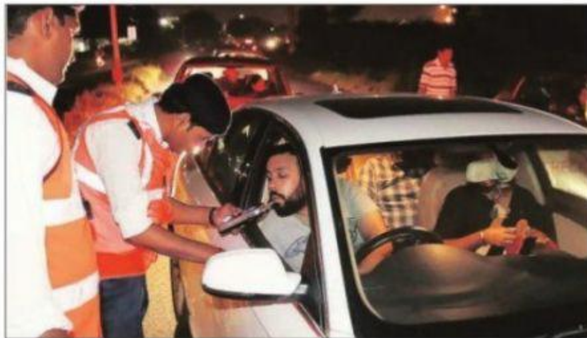
At a drunken driving naka at IT Park in Chandigarh.

The other traffic offences include driving without helmets, driving without seat belts,